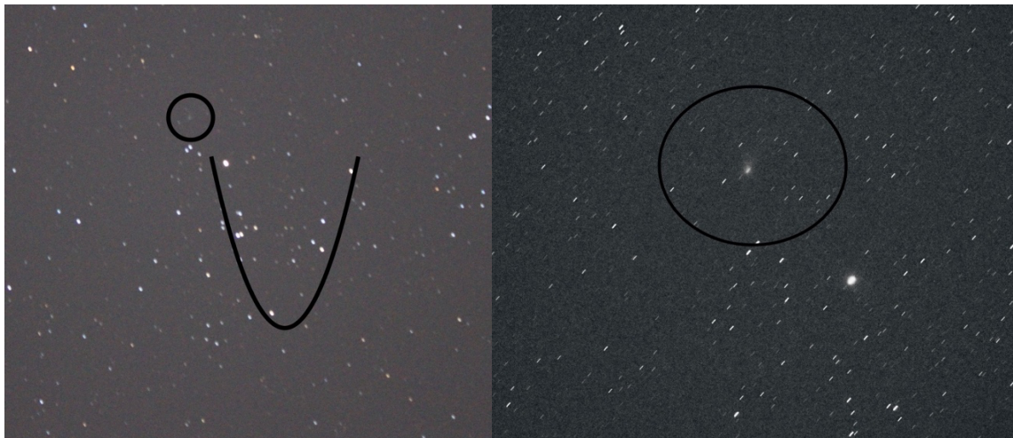
Comet just above the horns of Taurus

Comet C/2022 E3 ZTF: Also known as Comet ZTF, "the Green Comet" was not as bright as hoped, but it was a delight watching it on consecutive nights as it moved across the night sky. Pictures below, taken with a 300mm lens.