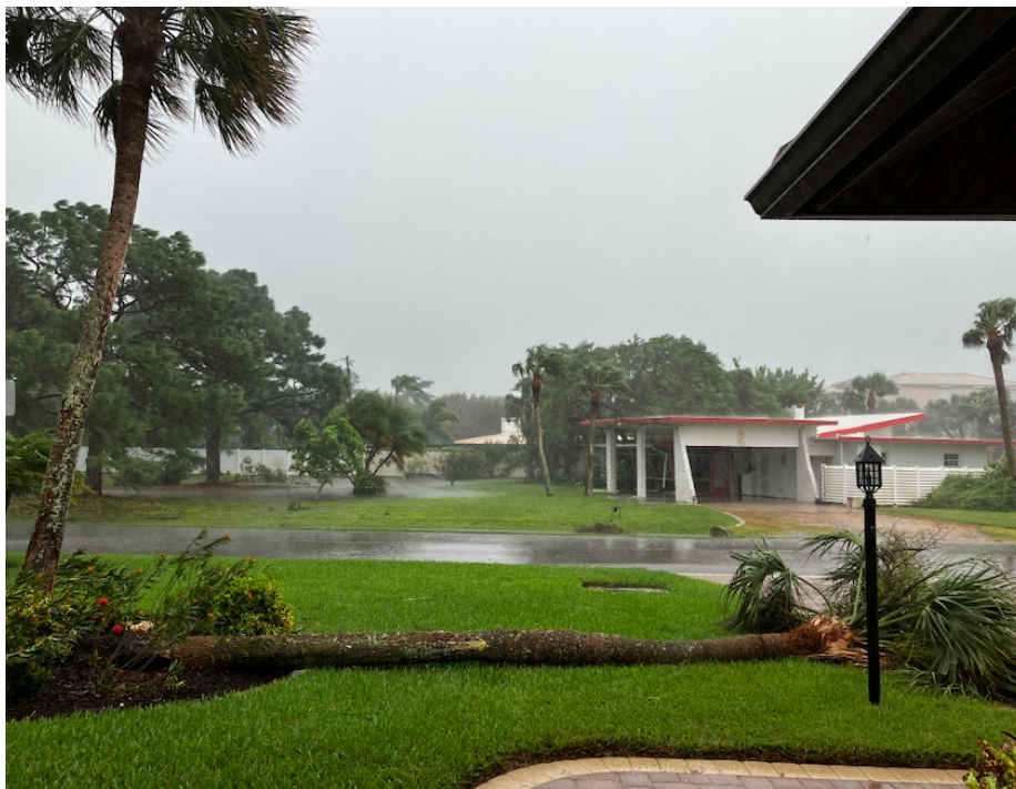
A few hours before peak storm force, ahead of Ian making landfall south of Golden Beach -- storm rain and winds were already strong enough that mature trees had begun to fall.