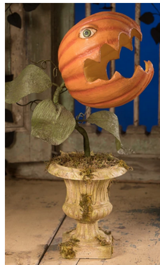
Sorry, this plant not available.

Milkweed for Monarchs ... this is the season before they migrate!