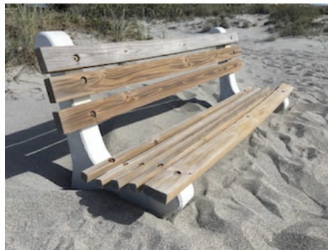
Before and ...