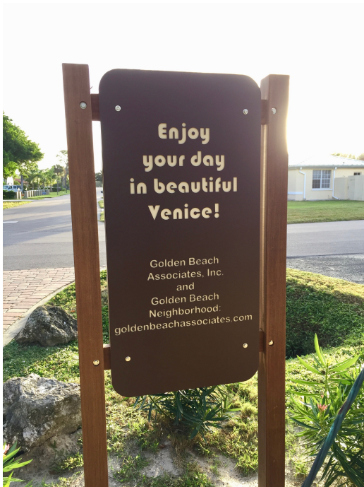
A parting message — Enjoy your day in beautiful Venice!