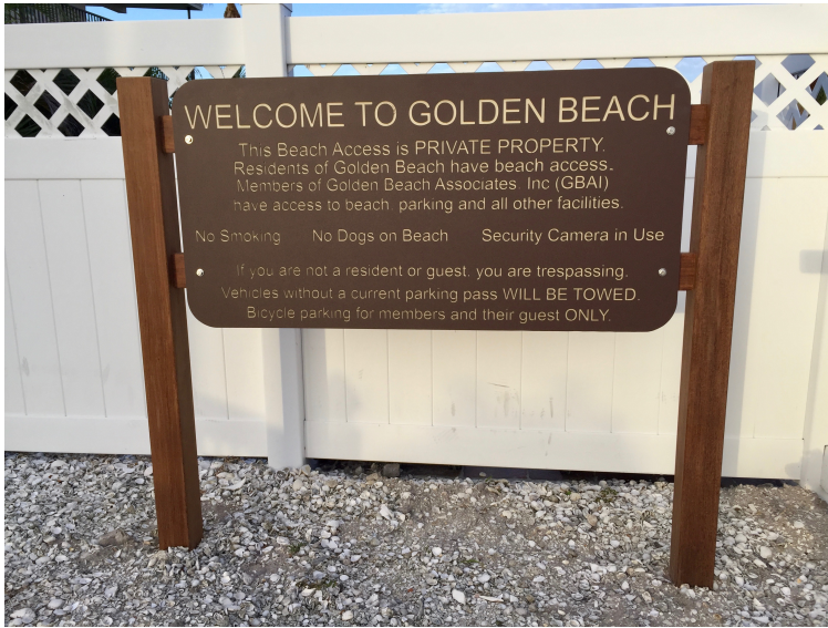
View of our new sign at the pedestrian entrance from the parking lot to the beach