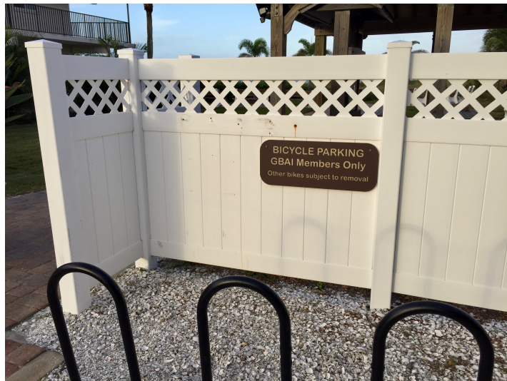
Bicycle parking signage, along with a freshly painted bike rack